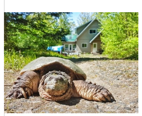
Tied 2<sup>nd</sup> ELI BASSAN (Long)