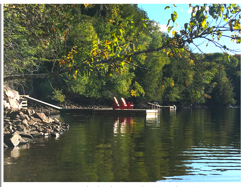
Miskwabi Lake, September 2019